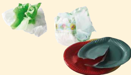
Dirty or greasy packaging, paper napkins, tissues, wet wipes, nappies