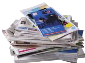
All kinds of paper: newspapers, magazines, brochures, letters, office paper, all papers.

These will be turned back into paper or cardboard