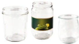
Jars, without lids