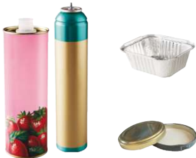
Metal lids and caps, Cordial bottles, aerosol cans, Aluminium trays

These will be turned into tins, car parts, etc.