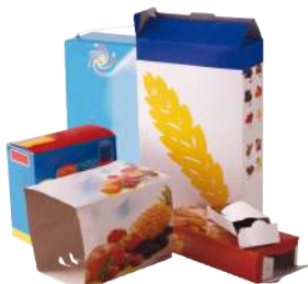
Empty cardboard boxes from cakes, yoghurts, cereals, washing powder, etc.