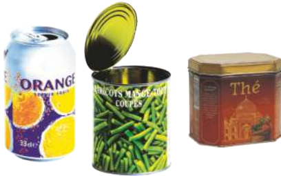
Cans, tins, tea tins