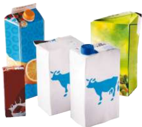
Empty milk, juice and soup cartons