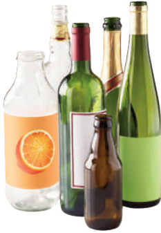
Juice, alcohol and oil bottles, without lids or caps