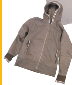
Clothes and shoes, bags, leather goods, household linen